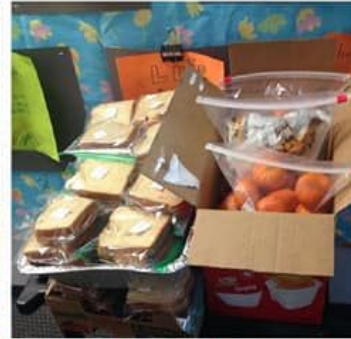
Lunches for Shelter in Reston

AFA monthly activities to practice Kindness and Rahma