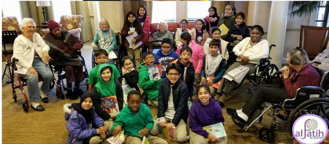
Senior Living Center in Reston

AFA monthly activities to practice Kindness and Rahma