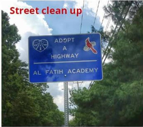
Street clean up